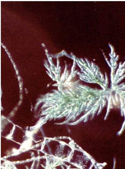
The green alga Draparnaldia.