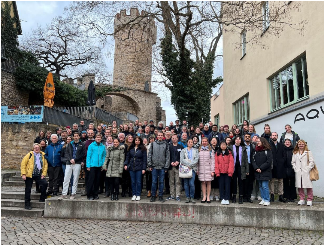
The participants of the 20 th Phycology Meeting in front of the old city tower in Jena.